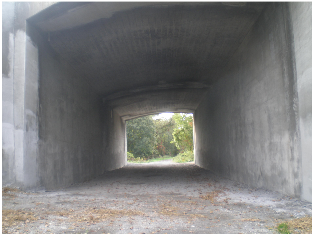
Looking north at the Thruway overpass on the Auburn Trail. The walls are 128 feet long. For safety reasons, the mural will only be 10 feet high.