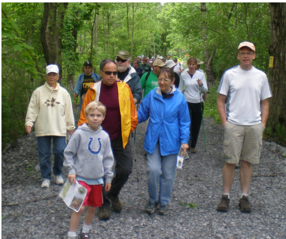
Some of the hikers on the Auburn Trail.