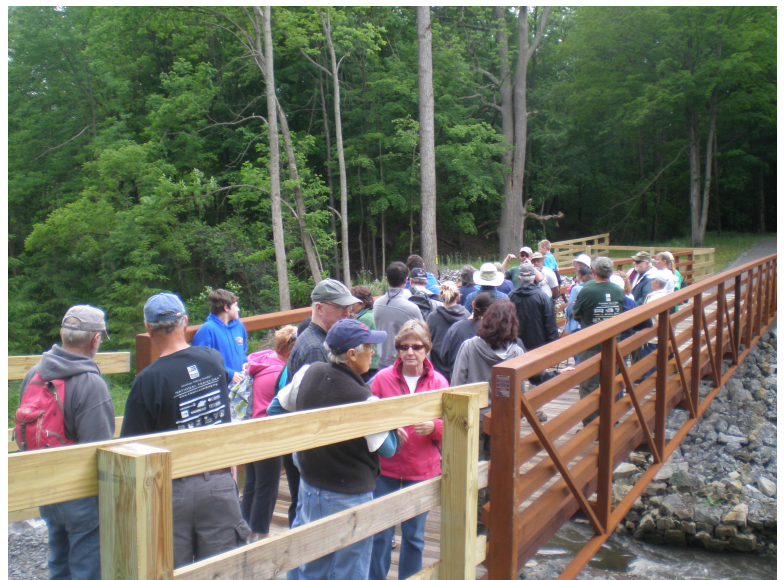
Crossing the new bridge over Irondequoit Creek.