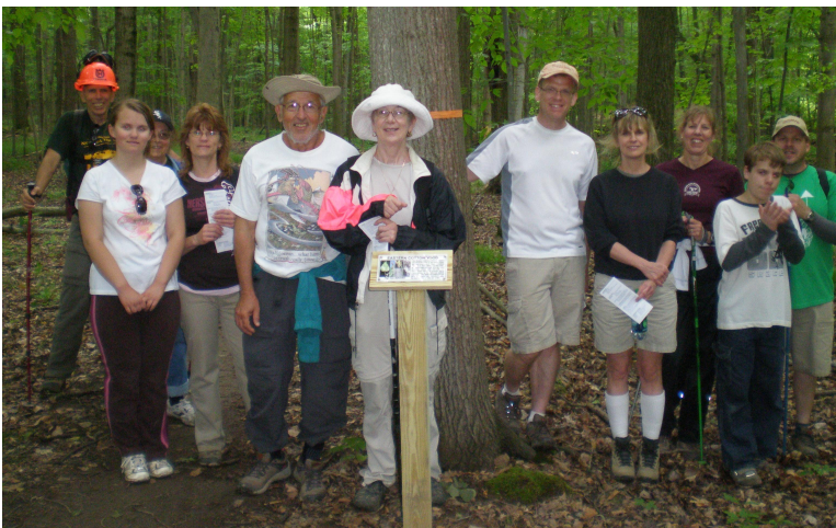
These hikers did all three hikes and are entitled to a free one-year membership to Victor Hiking Trails, Inc.