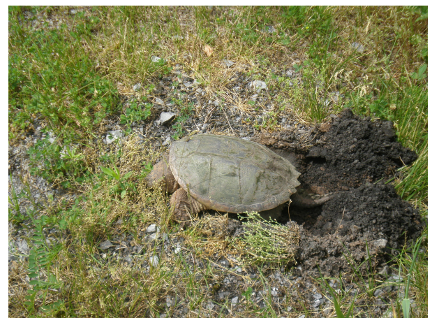
Momma turtle laying her eggs on the side of the Auburn Trail.